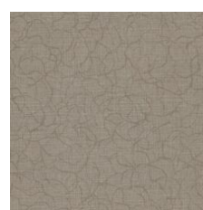
Stepping Stone 96700 Weldrod 12155