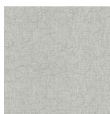
Zen 96515 Weldrod 01203