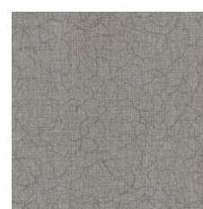
Pagoda 96710 Weldrod 05244