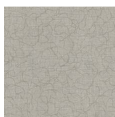
Pebble 96114 Weldrod 07332