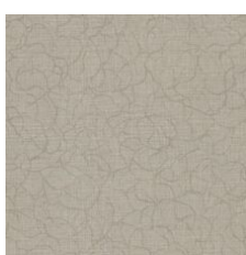
Tea Garden 96216 Weldrod 07332